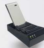
3pack Battery Charger