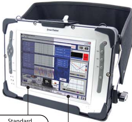
Standard LCD & Touch panel