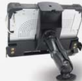
Vehicle Cradle with RAM mount